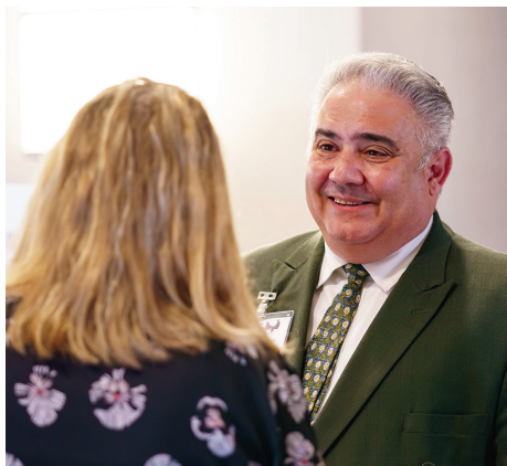
Judge Oscar Kazen

On the day I attended court, a young man was being discharged from the hospital to the AOT program. The hearing was to be held in the courtroom located on the grounds of the state hospital in San Antonio. Prior to calling the patient into the courtroom, the seasoned public defender approached the bench to let the judge